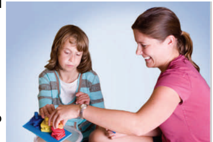
“Skills for the Job of Living”